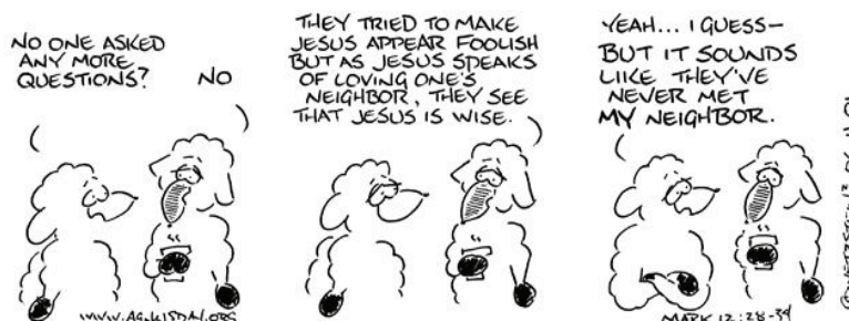
Agnus Day appears with the permission of www.agnusday.org